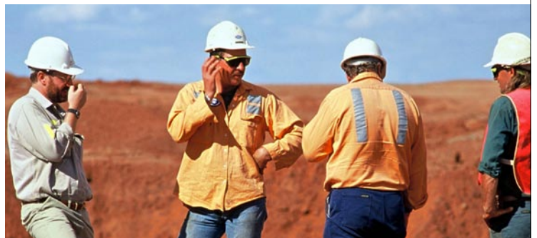
Mine workers at a remote Australian site: many have a higher risk of heart problems.

cardiologist’s analysis of an ECG using our unique web-based software system.”