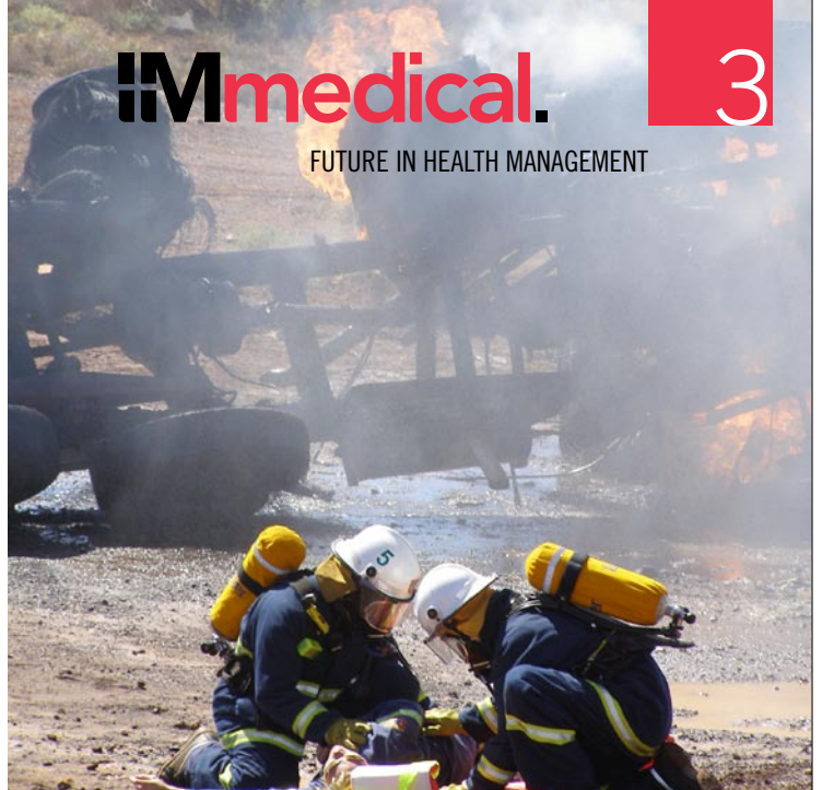
FRSA staff in a firefighting and first-aid exercise during a mines rescue competition.

He said: “There is a scarcity of cardiology services in regional and remote areas. With Intelliheart , we can supply an expert